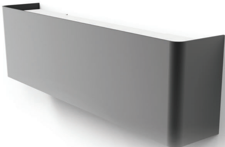
Decorative wall mounted lighting fitting